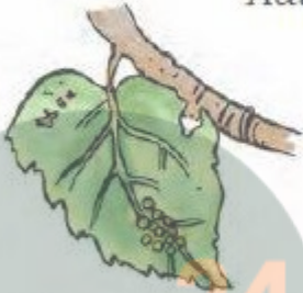
(c) Eggs on mulberry leaves