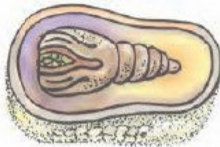
(f) Cocoon with developing moth